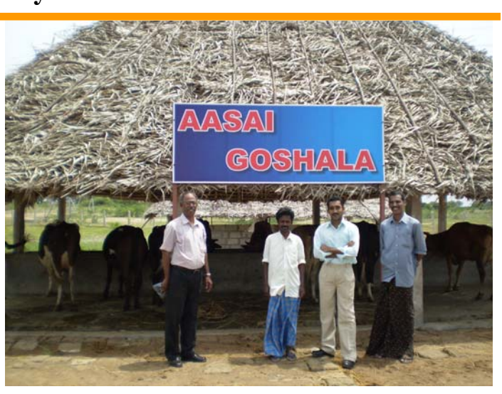
Ghosala (Cow farm) At Shantivanam

AASAI is continuing its support of Shanthivanam, Trichi. Tamilnadu. It is the residential dreamland of wandering, homeless, mentally ill destitute patients. Here the abandoned, disowned and deranged mentally ill are brought and treated for professionally and cared with lot of affection and unconditional love. Most importantly, this is done at no cost. After stabilization, these patients are rehabilitated in in a rehabilitation center and subsequently become independent. Thanks to the care at Shantivanam, many of them have been united and are leading a normal life. True to its objectives to help others so they can help themselves. AASAI initiated a Cow farm project, This project not only provides for