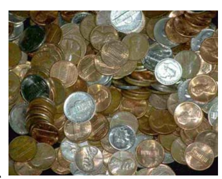
Your small change.... for a world of difference

citizen and abandoned street children homes that provide basic essentials for leading a dignified life. We have personally seen the direct and indirect impacts of our projects. By